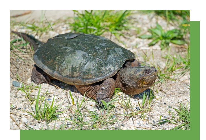
Common Snapping Turtle

The daily life of a turtle doesn't include a lot of activity and looking for the next meal fills plenty of the day. Predators don't provide much of a threat if you are adult size, but the small ones need to be aware of birds looking to keep their bellies full. You can also see these reptiles basking in the sun on our warm, sunny days.