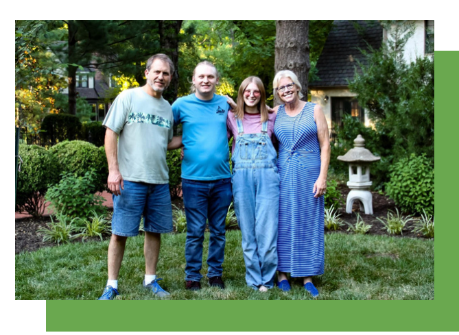
The Warwick Family

Being part of the Willow Waterhole Conservancy holds special significance for Mary as it brings her journey full circle. It allows her to return to her old neighborhood and release rehabilitated wildlife into the ponds of the greenspace, reconnecting with the natural environment.