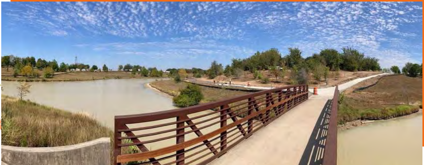
Construction photos credit Brett Byers