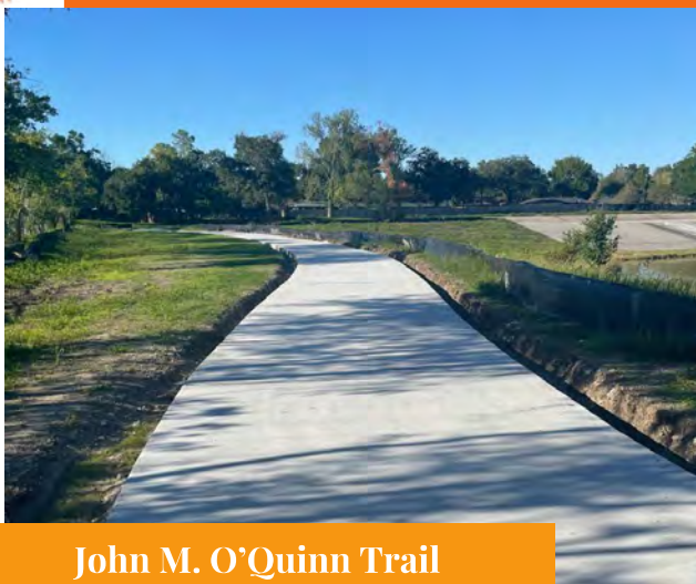
John M. O'Quinn Trail

The trail at Scout Lake will be named The John M. O'Quinn Trail to recognize the Foundation's support of the Willow Waterhole Greenway.