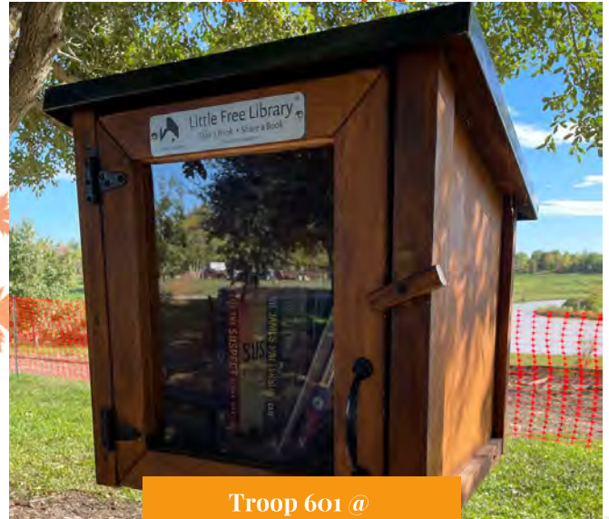
Troop 601 @ New Faith Bible Church