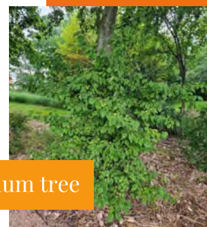
Mexican plum tree

Ripening in mid to late summer, the tree also produces a plum, which you can eat raw, although it tastes better if cooked or made into jelly. Several species of birds and small mammals also enjoy them.