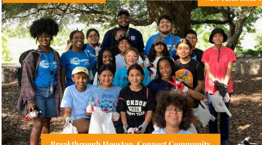
Breakthrough Houston, Connect Community