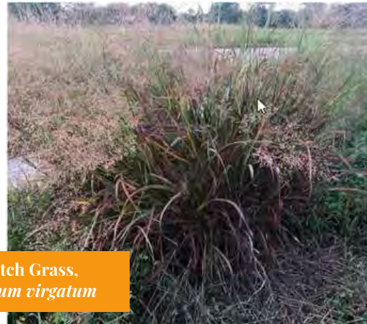
Switch Grass, Panicum virgatum

The Indian grass tends to grow along the edges of the gardens as it seeks the limestone leaching from the concrete. Its leaves are gray green, and its flower is a dense plume of beige seeds. It too benefits birds.