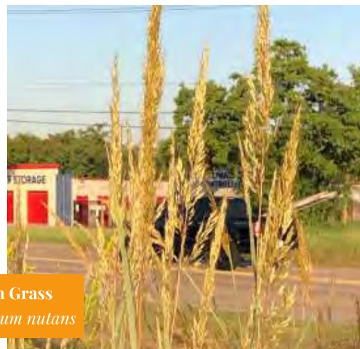
Indian Grass Sorghastrum nutans

We tend to disdain grasses, but they are very important, not just to wildlife, but also to the soil. Native grasses have deep roots to hold soil in place and absorb over abundant rainwater. They also have a beauty as they bloom and are churned by the wind in Autumn. Their appearance signals that the end of the growing season is near.