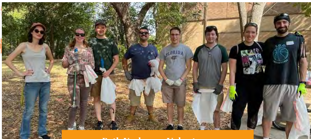
Beth Yeshurun Volunteers