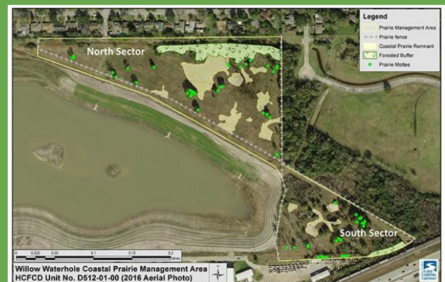
North and south of the lake are two “prairie management areas,” which include native grasslands and a future outdoor classroom to teach about conservation efforts