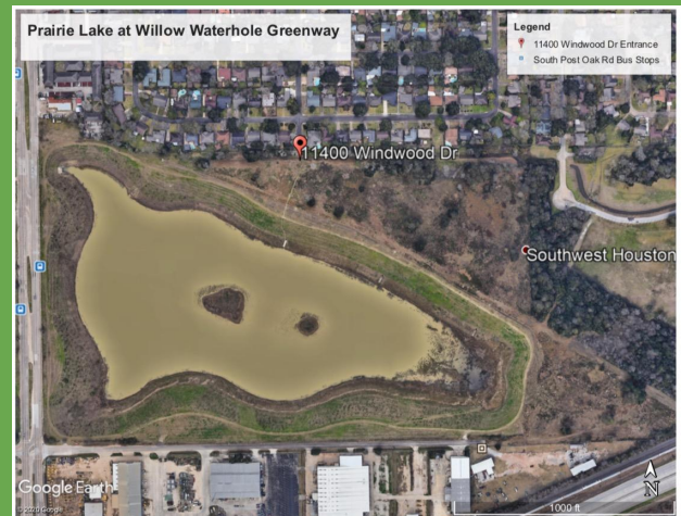
Aerial view of Prairie Lake, which is located near S. Post Oak and Gasmer Dr.

If interested, email info@willowwaterhole.org .