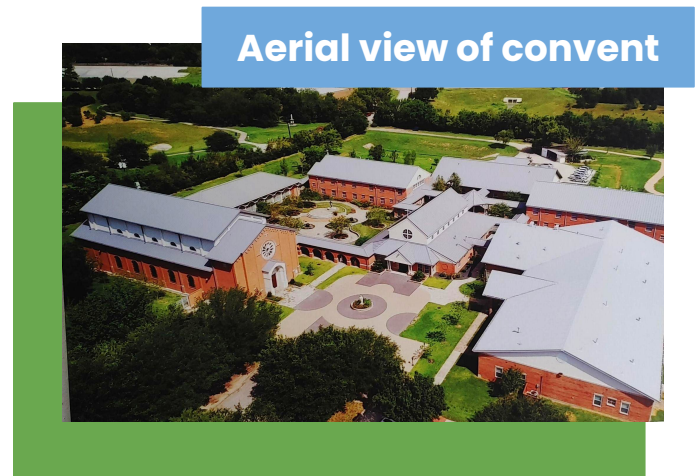
Aerial view of convent